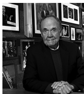
Dick Enberg, Playwright

Enberg's broadcasting career has spanned six decades and included numerous accolades as he established himself as